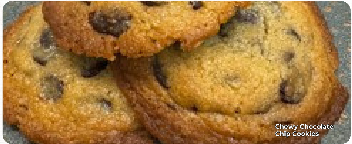
Chewy Chocolate Chip Cookies