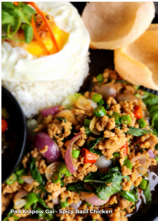
Pad Krapow Gai - Spicy Basil Chicken