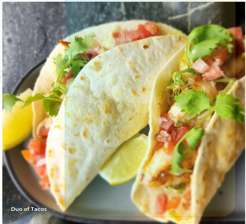
Duo of Tacos