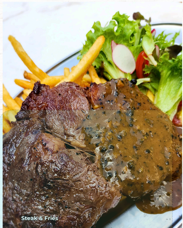
Steak & Fries