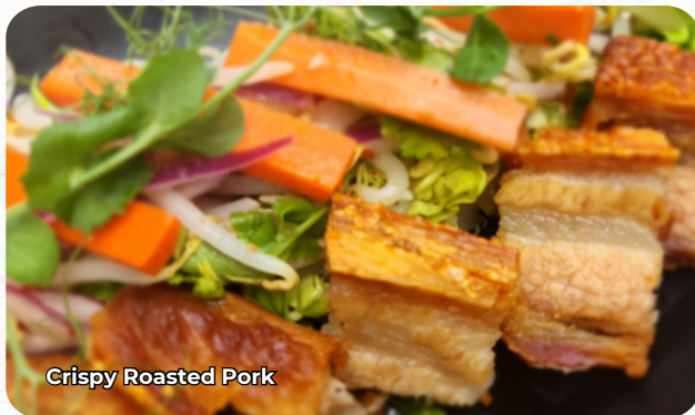
Crispy Roasted Pork